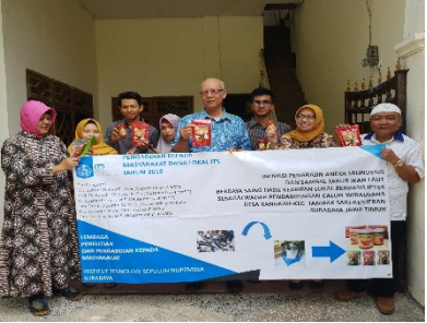
Figure 2. Documentation of activities with Serundeng SME partners and technology transfer