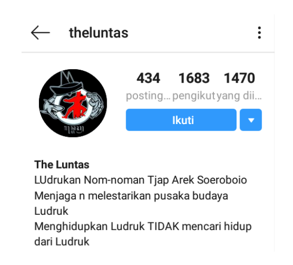
Picture 1. The Luntas Instagram account (https://www.instagram.com/theluntas/)

after watching their video and decide to attend The Luntas live performance. Youtube is used as promotion media by The Luntas because they think that many young people change their entertainment media from television to Youtube. Youtube has more than one billion users, almost one-third of all internet users, and every day people watch hundreds of millions of hours of video on Youtube and generate billions of views. As a whole, Youtube has reached more viewers aged 18-49 than any cable network in the world (Faiqah et al., 2016). The wide range of viewers on the internet might help them promote their work and, more importantly, the ludruk itself. The use of social media as the media of communication has been previously applied by another ludruk group which is called Marsuadi Laras. Social media opens a two-way communication model between the ludruk group and the prospective audiences of their performance. Social media aims to show to the public that today's ludruk performance is more attractive because they apply fresh and up-to-date concepts (Setyawati, 2019). The effort is made