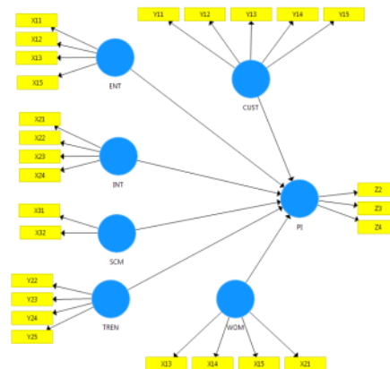
Fig. 1. Research Model