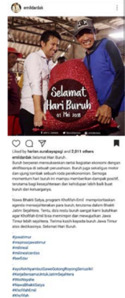
Fig. 6. Bakti 1 – Jatim Sejahtera uploaded by personal instagram account of Emil Elestianto Dardak @emildardak on May, 1st 2018.

The design in this campaign message is quite interesting. The use of interactive fonts coupled with epic packed messages, simple yet fairly representative of communication messages. Coupled with a not so long caption makes this design visualization comes alive. In the picture shown the focus of the message Nawa Bhakti Satya Khoffifah-Emil is then translated into several simple explanations, making this picture as an informative communication model of programs designed to welfare the target audience when they are later elected.