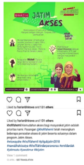
Fig. 4. Bakti 4 – Jatim Akses uploaded by the instagram account @khoffifahemil on April, 20th 2018.