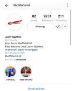
Fig. 7. The official instagram account of East Java governor and deputy governor candidates, Khoffifah Indar Parawansa and Emil Elestianto Dardak @khoffifahemil.

Looking at the target of voters in the election contest of governor and deputy, then the entire community of East Java in the age range of voters are audience target. Based on the data from the Central Bureau of Statistics, it is known that the population of East Java in 2017 is at 39,293,000 people with a ratio of 77% or about 30 million people are at voting age [5]. While on the official instagram account belonging to the pair candidate of governor and deputy governor Khoffifah & Emil Dardak @khoffifahemil as of June 20, 2018 there are 9,200 followers. It shows that the run of instagram publication reaches only 0.03% of the total campaign target.