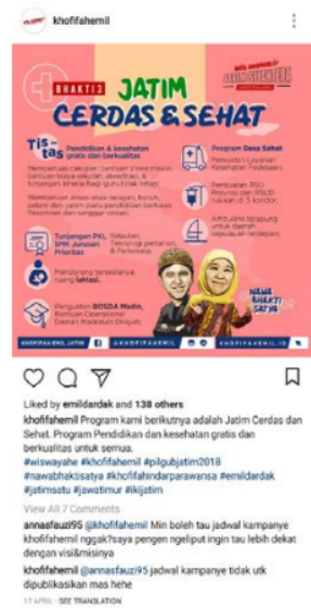
Fig. 3. Bakti 3 – Jatim Sehat & Cerdas uploaded by the instagram account @khoffifahemil on April, 17th 2018.