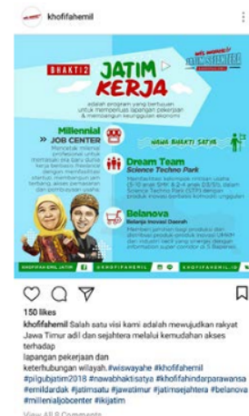
Fig. 2. Bakti 2 – Jatim Kerja uploaded by the instagram account @khoffifahemil on April, 15th 2018.