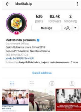
Fig. 8. Personal Instagram account Khofifah Inder Parawansa @khofifah.ip.