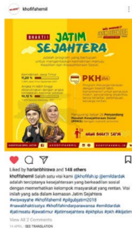
Fig. 1. Bakti 1 - Jatim Sejahtera uploaded by the instagram account @khoffifahemil on April, 14th 2018.