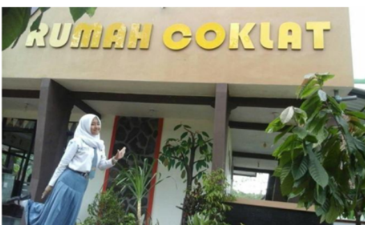
Figure 2: Chocolate House Educational Tour

However, the existence of Karangan Village as a tourist village is only seasonal and temporary for tourist visits in general. This can be seen at the inauguration of the chocolate house some time ago, when it was inaugurated and opened to the public, in a few months, the tour to the chocolate house was very busy and brought many visitors who came to the chocolate house tourist spot. However, only a few months later the visit to the chocolate house stopped and the crowd of tourist visits was not sustainable. So that investment in developing a brown house as a tourist visit has become quiet again recently, even now it tends to be empty of visitors.