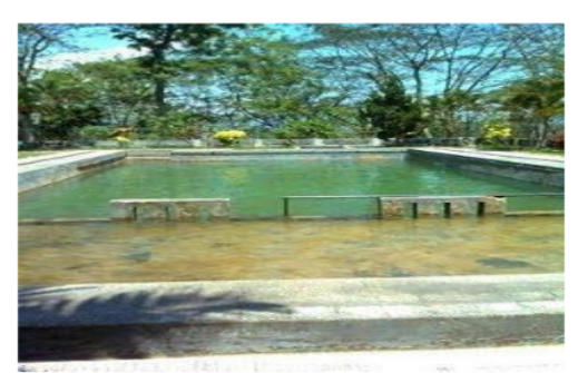
Figure 3: Tapan Forest Tourism Bathing Place, Karangan Village

Likewise what happened to the tourist destinations for the public baths in Tapan, only a few moments later, the visits to the Tapan baths were crowded with tourists, however, in just a few moments then it was quiet again, so from the investment aspect of the development of the Tapan bath tourist destinations, becomes less profitable between the treatment and the results obtained from tourist visits to the area.