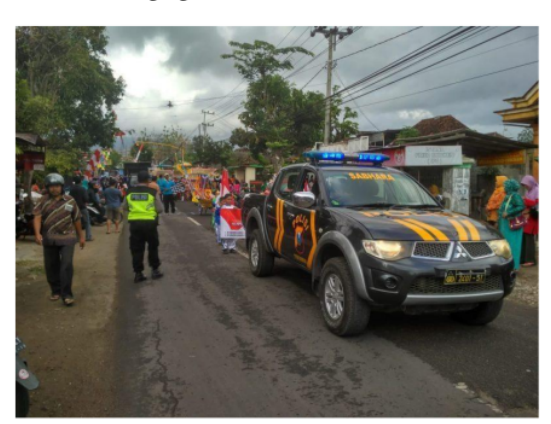
Picture 4: Karangan Village Cultural Tourism Event, with the Turonggo Yakso attraction.

Cultural events in the form of carnivals in Karangan village: Whether in the form of a Kopatan day event in the context of Idul Fitri, village clean-up events, a carnival event to commemorate independence day, etc. are also interesting tourist events and always get appreciation from the community at large. So that this event is also very supportive of increasing tourist visits in the Karangan Village environment of Trenggalek district as an effort of the Local Village Government to increase tourist visits to the Karangan village, this cultural event can be seen in the following figure: