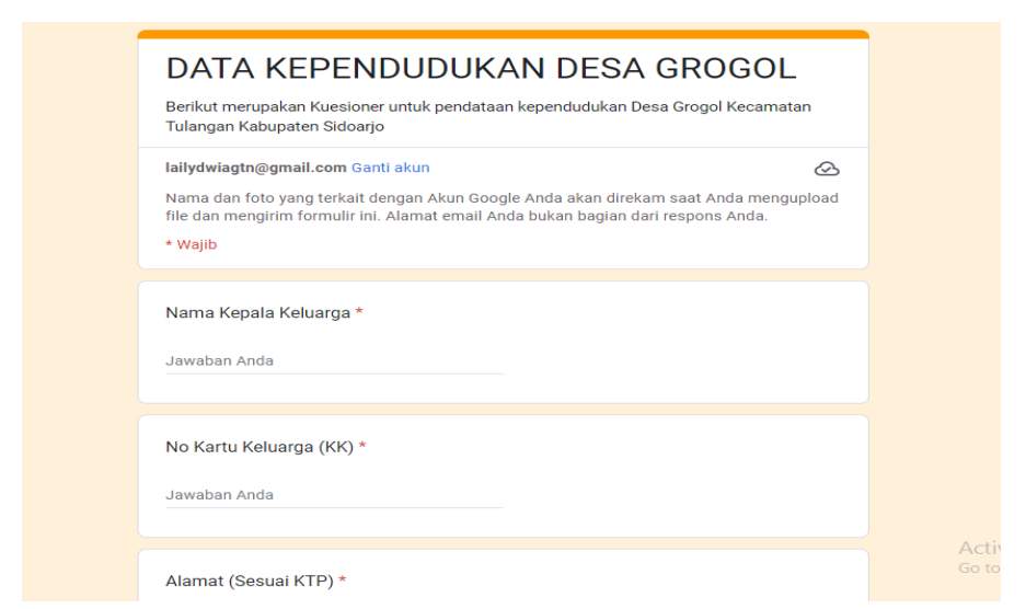
Figure 5. Product results of Population Data for Grogol Village

c. Create links google formand Bit.ly regarding Population Data for Grogol Village, this is done as a form of effectiveness and efficiency so that staff and the community can access population data if needed and can reduce the use of paper archives. The product results are obtained in the form of <a href="https://bit.ly/Datakependudukandesagrogol">https://bit.ly/Datakependudukandesagrogol</a>. Figure 5 shows an overview of the product.