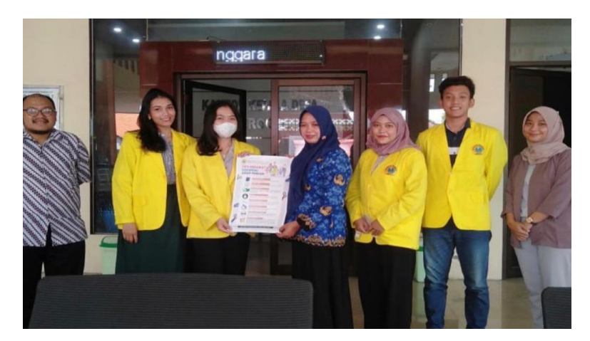
Figure 3. Demonstrates how to properly manage digital archives in poster form

a. Provide counseling and training on digital archives. This aims to be able to help the public to understand the importance of digital archives and howa how to manage it well.