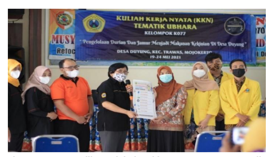
Figure 1. Duyung Village Digital Archive Management Counseling

a. Provide counseling on digital archive management which includes how to manage, store and maintain digital archives so that their authenticity, truth and existence are maintained as shown in figure 1.