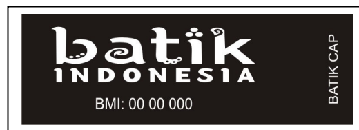
Picture 3. Lable batikmark Batik Kombinasi

Batik SNI is also explained in the Decree of the Head of the Indonesian Standardization Agency Number: 188/KEP/ 8/2016 concerning Establishment of Revision of 3 (three) Indonesian National Standards, namely: