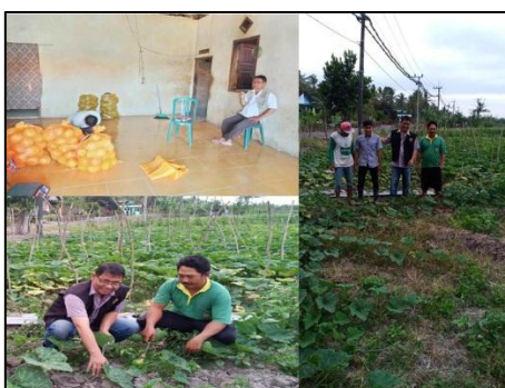
Figure 1. Co-authoring with informants (farmers, collectors, suppliers, etc.) Source. Field documentation (2019-2020)