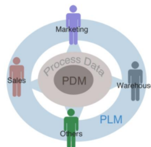
Fig.3: Production Data Management

The records collected for product statistics management is processed for deployment to be utilized in other strategic structures in the course of the corporate. The opposite systems structure the merchandise lifecycle management. The statistics amassed for product information management is processed for deployment to be applied in other strategic systems at some point of the corporate. The other structures structure the products lifecycle management.