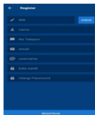
Figure 2. Registration Page Display for New Users of the Sapawarga Application

E-Sapawarga is one of the innovations of the Surabaya City Government in supporting the wishes of the citizens of Surabaya in accordance with the Regulation of the Mayor of Surabaya Edition 5 of 2013 concerning Guidelines for the Use of Information and Communication Technology in Local Government Actions, E-Sapawarga, which is accessed through the playstore, was originally launched as E -RT / RW and can be accessed by the Head of RT / RW in Surabaya, which later changed its name to E-Sapawarga so that it can be accessed by all Surabaya people. Easy access to the E-Sapawarga application site can be downloaded via Playstore and you need to register first.