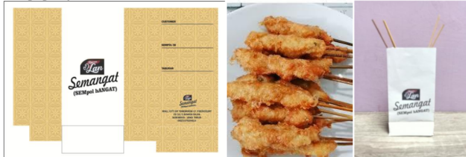
Figure 4.3. : Sempol Food Packaging