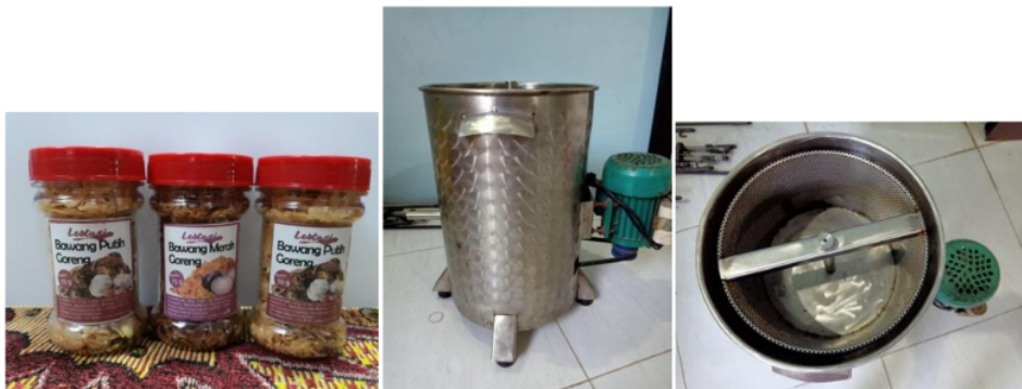
Figure 4.5. Bottled Fried Onions

2. After the fried onions are dry then the next step is to put them in a bottle then cover with aluminum foil and press them with a pressing device so that they can last for months.