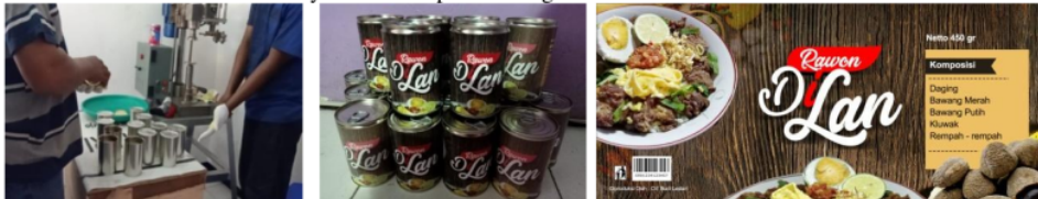
Figure 4.5. Rawon in Canned Packaging

6. After the cans are cold and dry the next step is labeling.