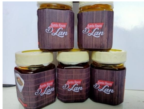
Figure 4.4: Rawon packaging in plastic bottles

c. Packaging Way Rawon seasoning that has been ripe in a warm state put in a bottle that is closed with aluminum foil and pressed with a pressing device, then labeled.