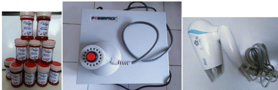
Figure 4.2. : Sempol products from Mrs. Sunarsih

After the chili paste is cooked, remove it from the stove and let it stand for a while until it is lukewarm, then put it in a plastic bottle then cover with aluminum then put it in the pressing tool and label it and finally seal it with a plastic seal using a hairdryer heater so that it lasts long.