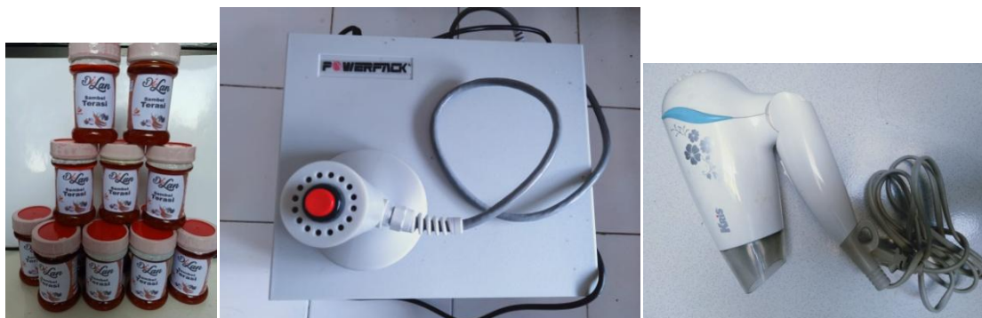
Figure 4.2. : Sempol products from Mrs. Sunarsih

After the chili paste is cooked, remove it from the stove and let it stand for a while until it is lukewarm, then put it in a plastic bottle then cover with aluminum then put it in the pressing tool and label it and finally seal it with a plastic seal using a hairdryer heater so that it lasts long.