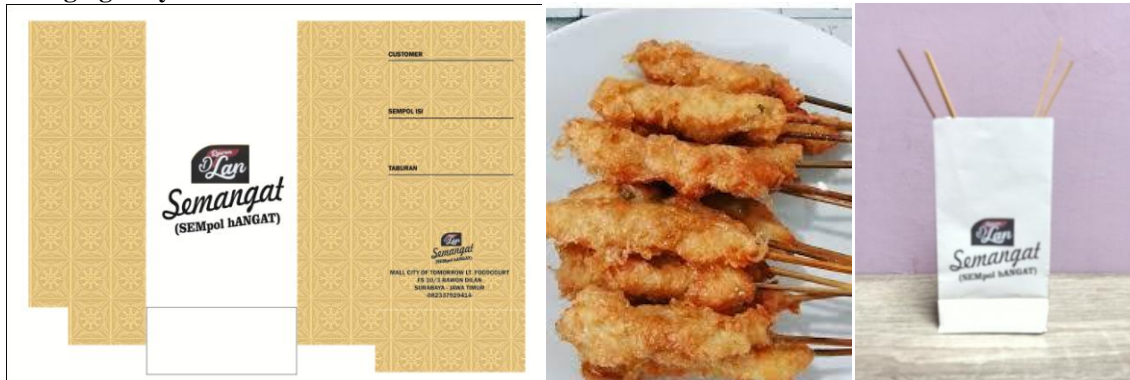
Figure 4.3. : Sempol Food Packaging