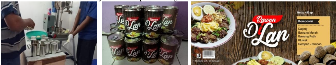
Figure 4.5. Rawon in Canned Packaging

6. After the cans are cold and dry the next step is labeling.