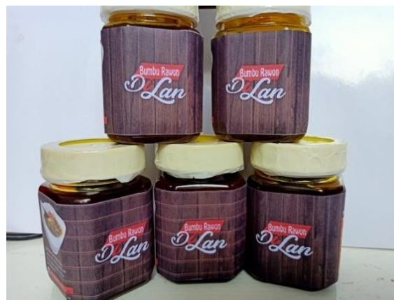
Figure 4.4: Rawon packaging in plastic bottles

c. Packaging Way Rawon seasoning that has been ripe in a warm state put in a bottle that is closed with aluminum foil and pressed with a pressing device, then labeled.